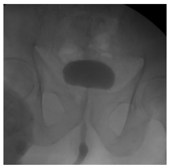
Figure 5. Cystogram performed after fistulectomy surgery

No extravasation was observed on the cystourethrogram performed after the postoperative first month ( Figure 5 ).