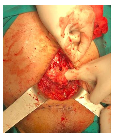
Figure 4. Fistula stemming from the anterior wall of the urinary bladder and the perforation site

The patient was re-admitted, and a Foley catheter was placed. The urine leak was followed for one week; however, it persisted. A fistulectomy was planned. During exploration, a perforation area with a diameter of 1.5 cm and a vesicocutaneous fistula stemming from the anterior wall of the bladder were detected ( Figure 4 ).